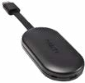
1. Front View