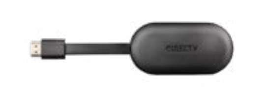
2. Top View